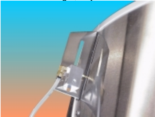
Standard: Single, Adjustable Air Jet