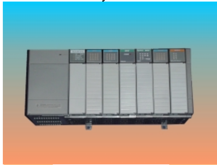
Allen Bradley SLC 501 PLC