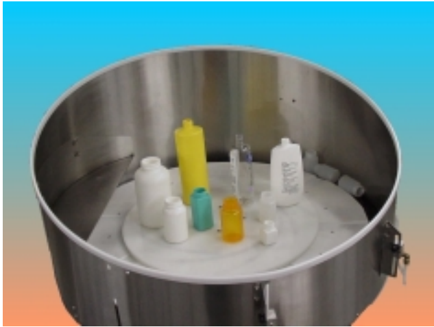
Typical range of containers.