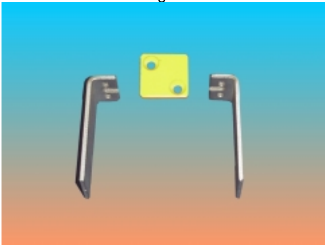
Pocket/Straight Side Arms