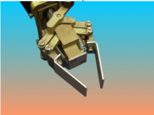
Standard Mounting Blocks tools required